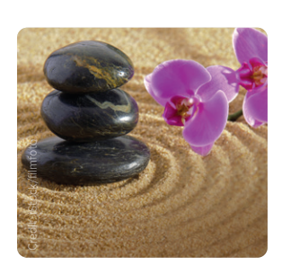
THE TAX BURDEN ON HIGH INCOME