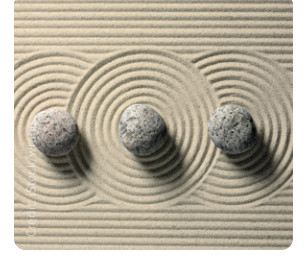
SELF-INVESTED PERSONAL PENSIONS (SIPPS)

The investment option that lets you control how and where your money is invested