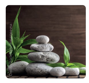
THE POWER OF YOUR PENSION

The investment option that lets you control how and where your money is invested